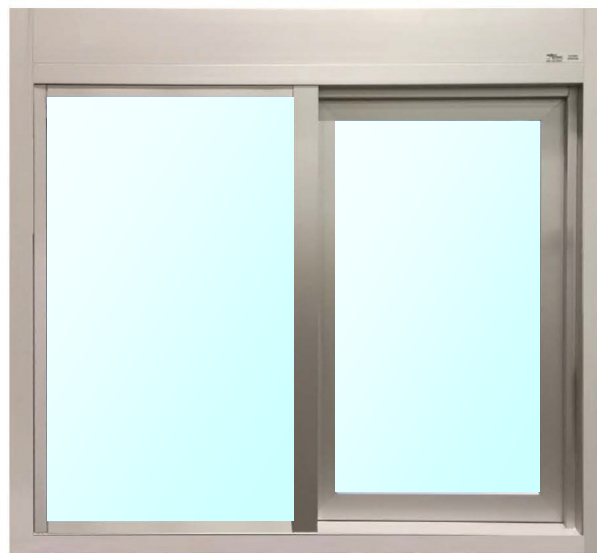
Pictured: right to left from outside view, clear anodized finish.

600 SECURITY Choose Lexan Level 1 or Smash & Grab glass, and a security bar set for protection against forced entry.