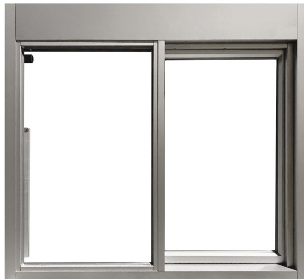
Pictured: Right to Left from outside view

Fully automatic electric, for hands free open & close. Operator steps into overhead beam to activate.