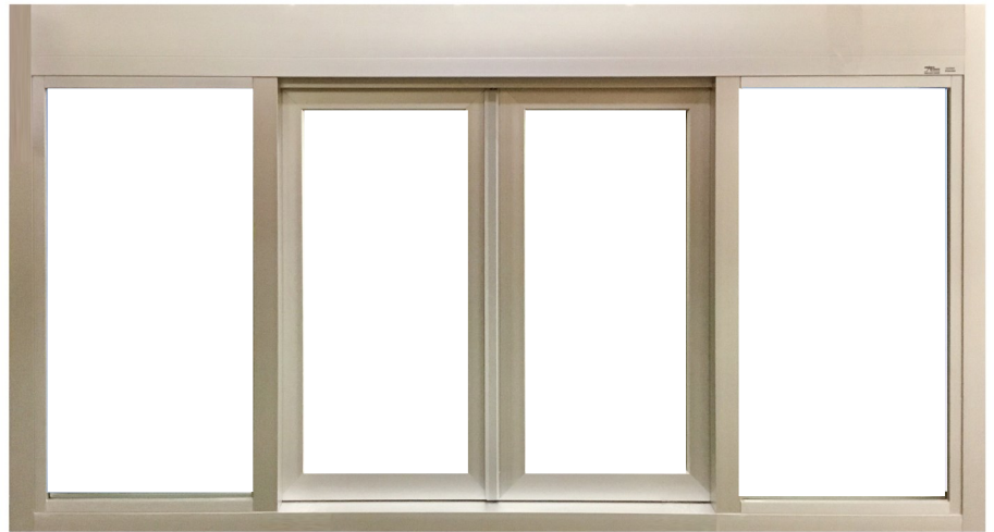
606-80 shown with clear anodized frame