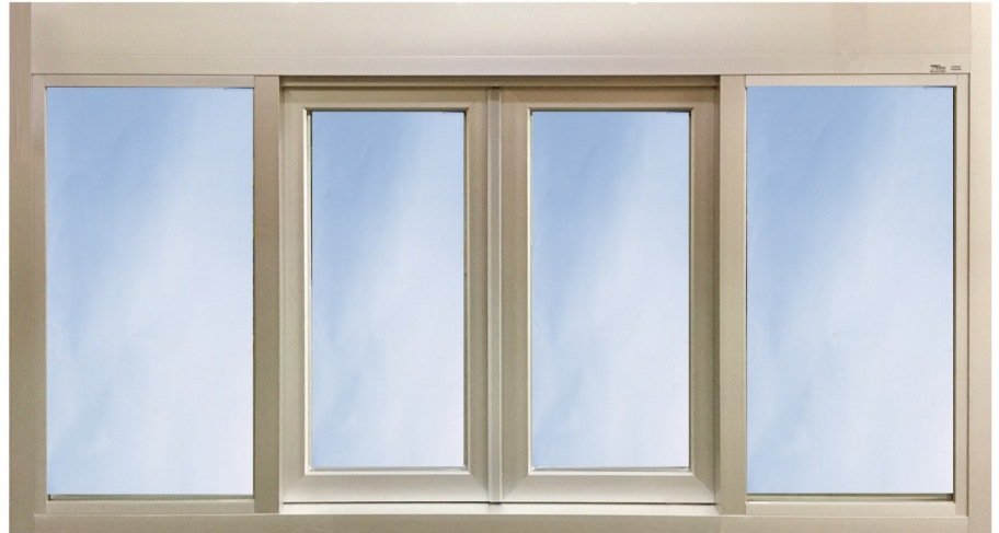
606-80 shown with clear anodized frame - features a large 34" w service opening