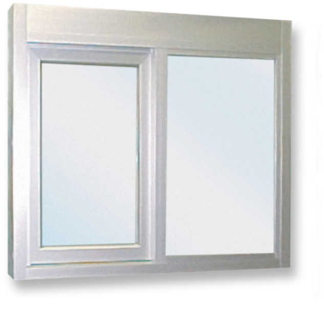
Pictured: left to right from outside view, clear anodized finish.